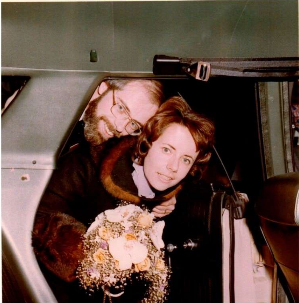
The Bride And Groom